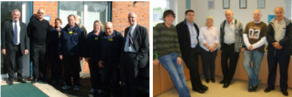
Visitors from SLATE in Leeds and Visitors from REBOOT in Inverness

We host many visits from organisations and individuals who come to us to research the workings of a successful social enterprise in computer recycling. This time they came from as close as Leeds and as far away as Inverness.